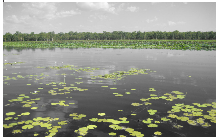
Water lilies, Mamukala Wetland, South Alligator Region.

The Mamukala Bird Hide Walk is considered to be one of the 'must do' walks to be upgraded, promoted and marketed within the Park. There are currently no 'approved bushwalking routes' or recommended Kakadu Bushwalks within the District.