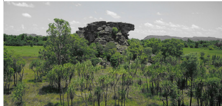
Sandstone outcrop, East Alligator Region.

The Ubirr Loop, Ubirr Lookout and Bardedjilidji walks are considered to be 'must do' short walks to be upgraded, promoted and marketed. There are currently no 'approved bushwalking routes' or recommended Kakadu bushwalks within the District. Consultation with traditional owners indicated priority to upgrade and manage short-day walks, rather than developing new short or overnight walks.