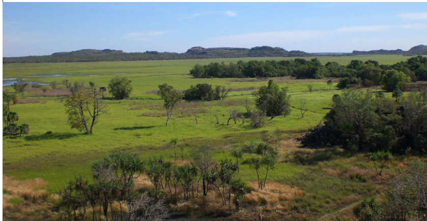
Wetlands from Ubirr, East Alligator Region

The Kakadu Board of Management advised that continued access to overnight bushwalking opportunities in the Park will be influenced by the conduct and impact of bushwalkers, and that closure of routes will be considered in the event that compliance with conditions set out in the draft Strategy and/or permits/licences are not demonstrated.