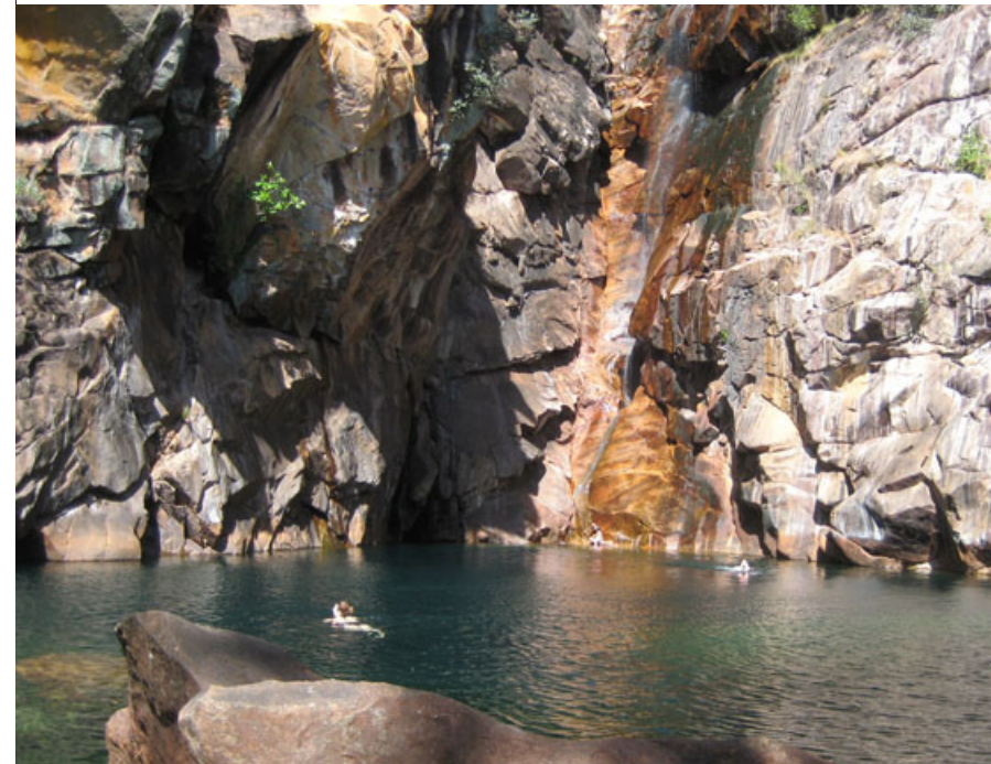
Motor Car Falls and plunge pool, Mary River District.

Traditional owners from the Mary River District area would like a route within this district to be assessed as a potential Kakadu Bushwalk. Possible routes between Jarrangbarnmi (Koolpin) and Gunlom were suggested, or a route between Gunlom-Maguk-Bilkbilkmi. The latter option requires consultation with the traditional owners of the Maguk-Bilkbilkmi country.