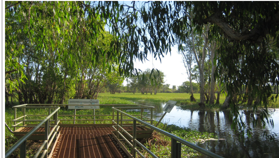
Yellow Waters Boardwalk, Yellow Waters Region

The draft Kakadu National Park Walking Strategy provides the basis for a consistent and sustainable approach to the planning, development, management and promotion of walking opportunities within the Park. Like the Kakadu National Park Management Plan, the Walking Strategy is a joint management document, based on extensive consultation with traditional owners and other Bininj/Munguuy of Kakadu.