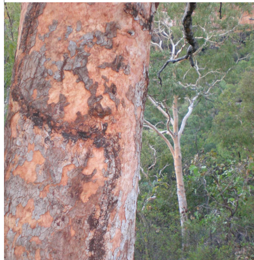
Barrk Walk, Nourlangie area.