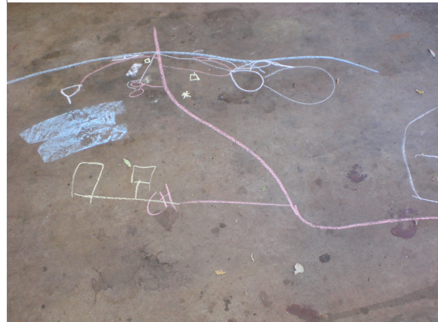
Chalk map indicating the location of short walks, Mary River Region traditional owner consultation.

In addition to consultation and research, the consultants walked all of the short-day walks available in the Park, and visited major attractions to gain a first hand understanding of the environment, and visitor facilities and services.