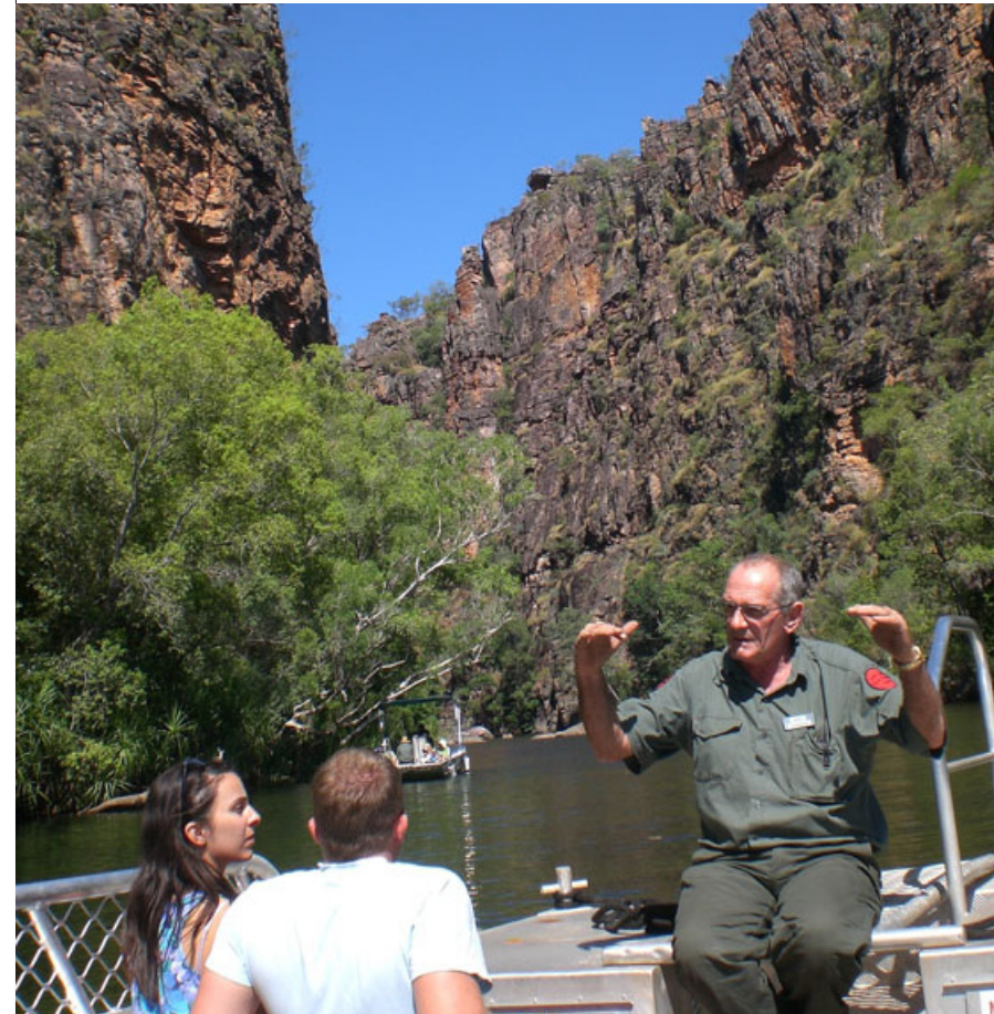
Guided tour, Twin Falls Gorge, Jim Jim and Twin Falls Gorge Region.

The recommended actions listed within the 10 Year Action Plan will all impact on the planning, development and management of walks within the Districts. The following pages provide a brief summary of some of the more specific aspects in relation to the individual walks and bushwalking routes within each of the Districts.