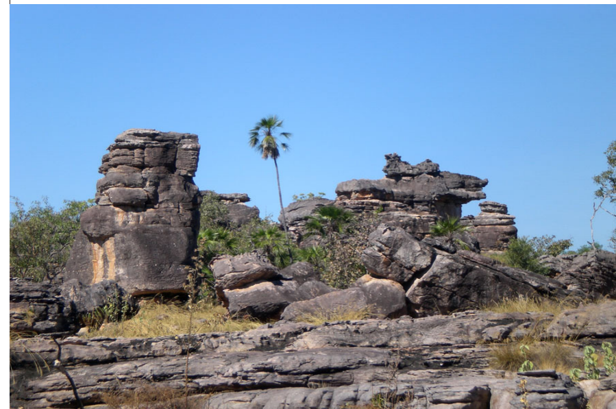
Sandstone outcrops, East Alligator Region

Whilst overnight bushwalking is a significant segment of the walker market in the Park, short-day walks are by far the most popular types of walks undertaken by visitors.