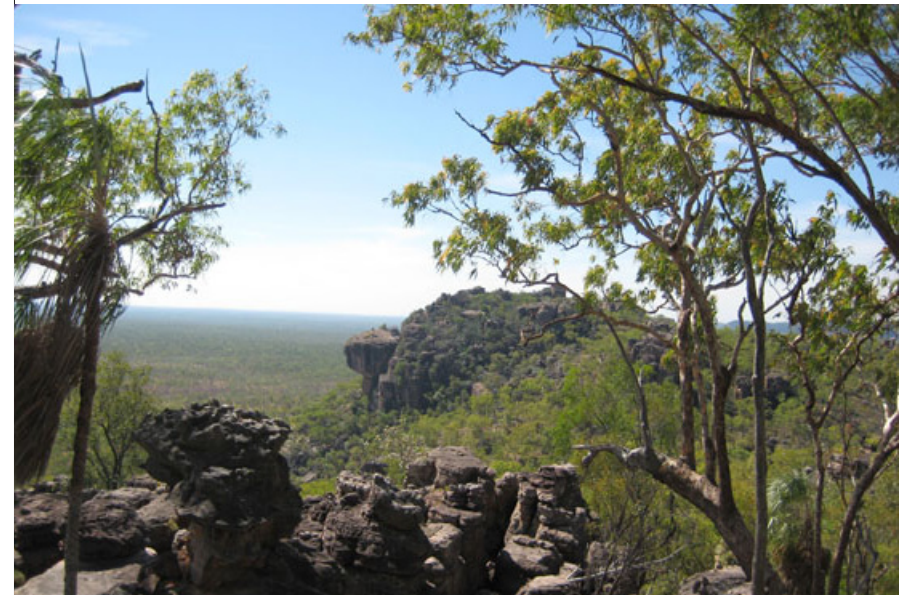
View north from the Barrk Walk, Nourlangie area.

During the last round of consultation, traditional owners indicated that they do not want bushwalking to occur in the Mount Brockman area beyond the Gubara Pools day walk, until cultural heritage assessments are carried out and the cultural significance of sites can be properly determined. The assessments will help traditional owners determine whether other routes may be accessed for bushwalking in the future.